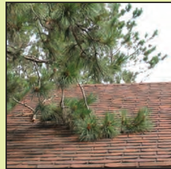
Trim all overhanging branches.