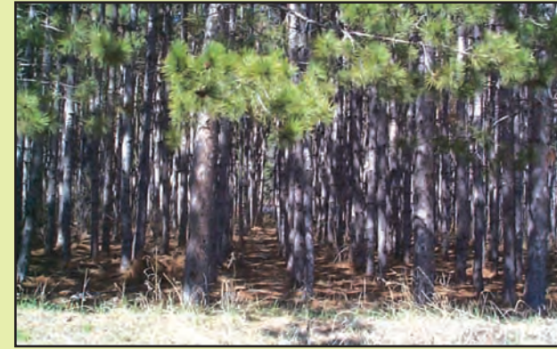
Pine rows need to be thinned.